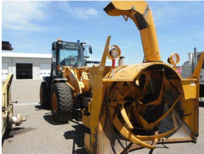
Figure 3-8. Snow blower is an attachment that is used to remove large quantities of snow.