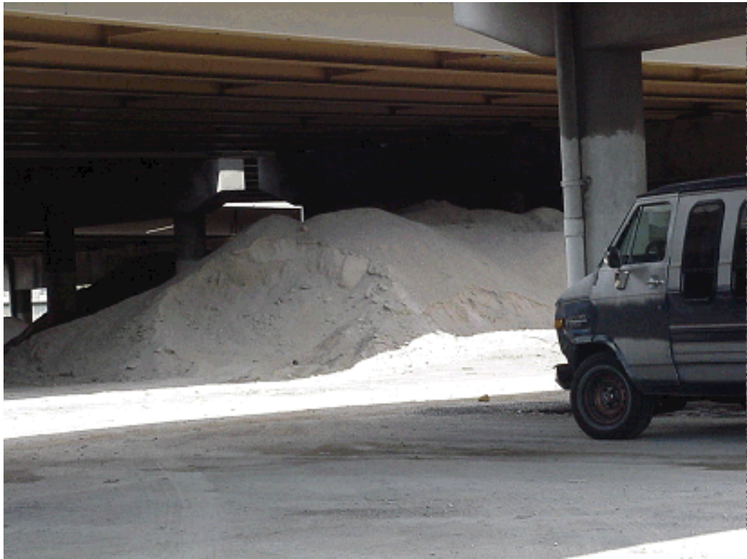
Figure 5-11. Salt storage under a bridge next to bridge columns.