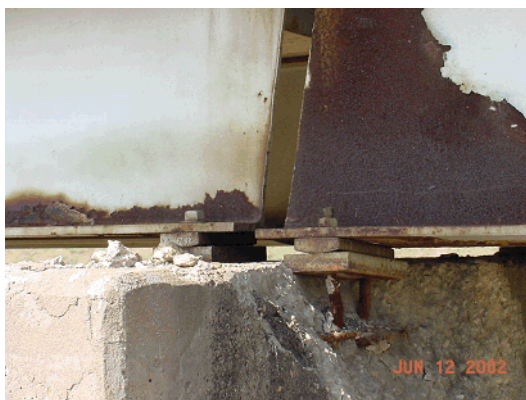
Figure 5-8. Failure on cap due to corrosion damage. Bridge was closed until repair could be performed.