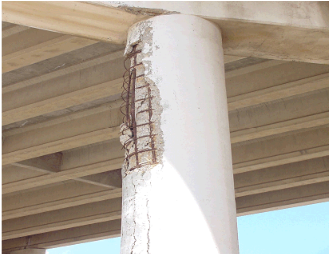
Figure 5-9. Column deterioration from chemical solution contamination.

To eliminate chemical damage to columns, do not store chemical materials next to columns and maintain and repair bridge joints.