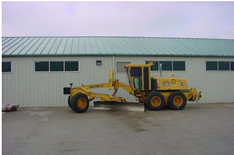
Figure 3-2. Motor-grader (maintainer) - This may be the best piece of equipment we have for snow removal. It does not require any other attachments to do the job. This piece of equipment is self-contained and ready to go.