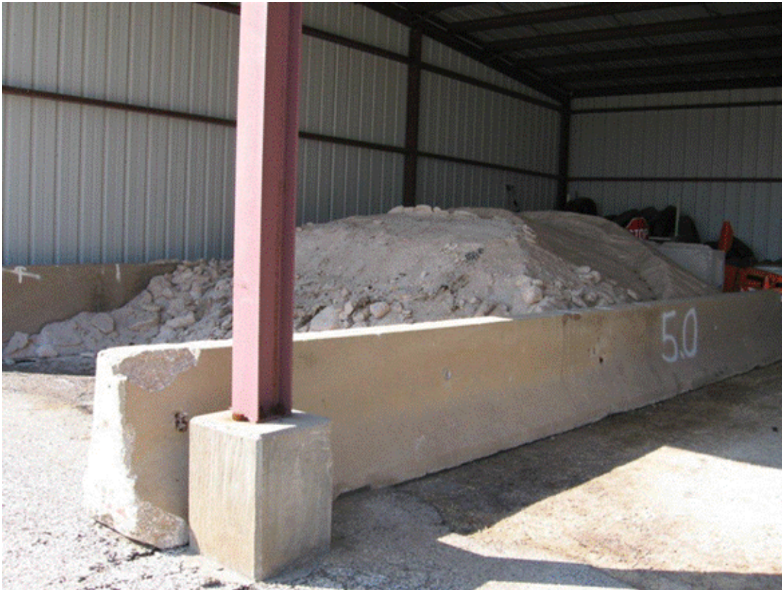
Figure 2-4. Salt Storage at TxDOT Maintenance Section Warehouse