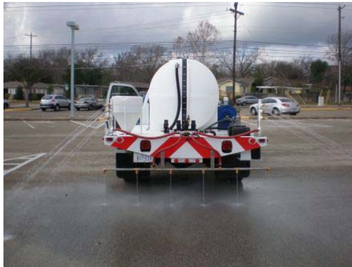
Figure 3-9. The herbicide rig is used to apply anti-icing liquids prior to an approaching storm. It is also used for de-icing applications during the storm.