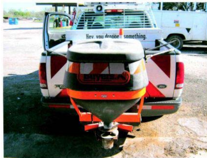
Figure 3-10. Pickup applicators are used to apply anti-icing liquids (top) and granular (bottom) materials prior to an approaching storm to small areas such as bridge decks, on and off ramps. They are also used for de-icing applications during the storm.