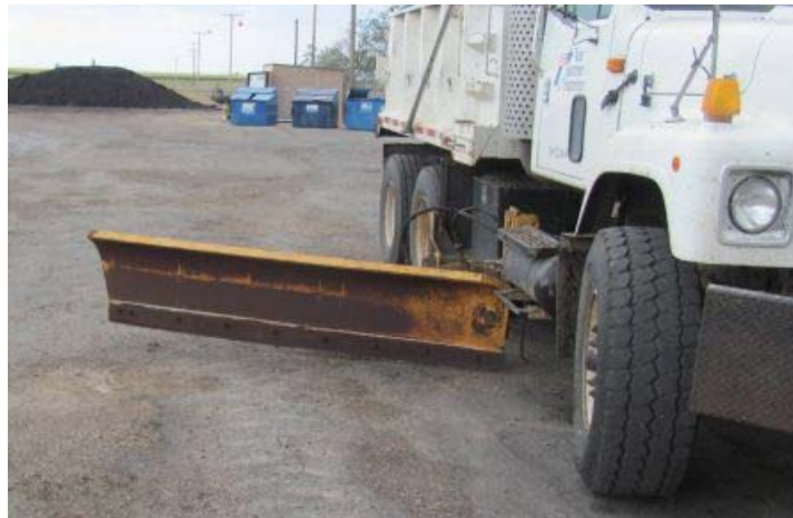
Figure 3-7. The snow wing attachment provides extra width on a motor grader or truck for plowing two lanes at a time or picking up a lane and a shoulder at the same time.