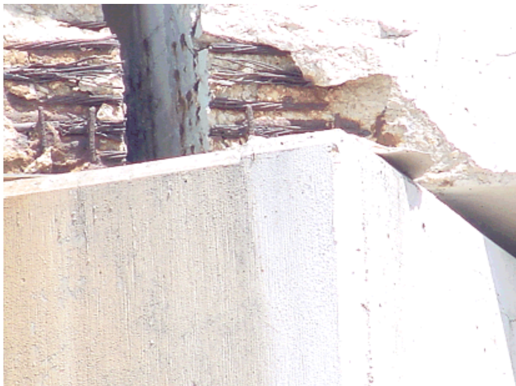
Figure 5-6. Close up of Figure 5-5.