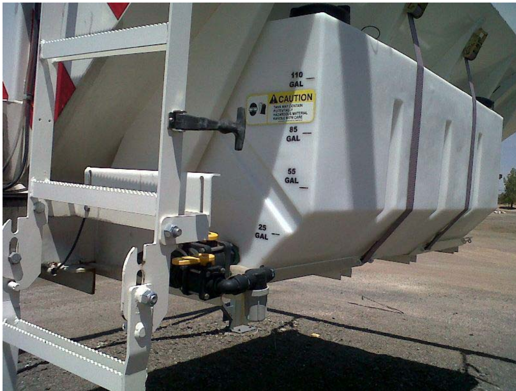
Figure 2-2. A saddle tank is a useful means of pre-wetting solid chemicals.

The practical result is a reduction in the resources necessary for maintaining the highway since a lower application rate translates into a spreader load covering more area, often requiring less dead-heading (returning to the barn empty) to obtain material.