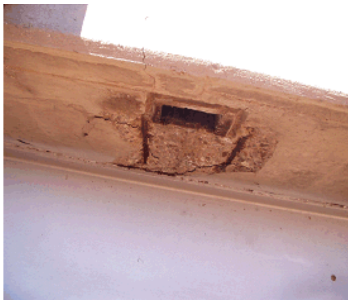
Figure 5-2. Corrosion damage due to concentrated de-icing solution at drain site.