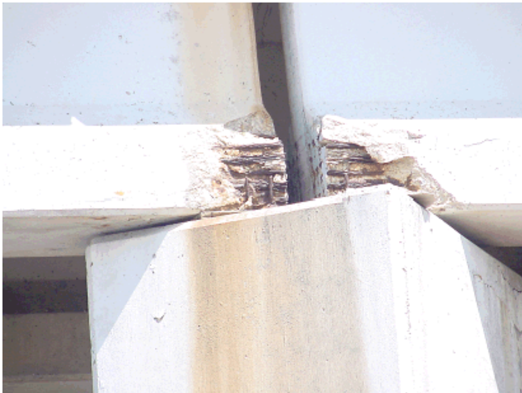
Figure 5-5. Chemical solution corrosion induced beam damage created by failed joint and poor concrete cover over beam ends.

Maintenance personnel should repair and maintain joint systems ensuring the protection created by the sealed joint systems.