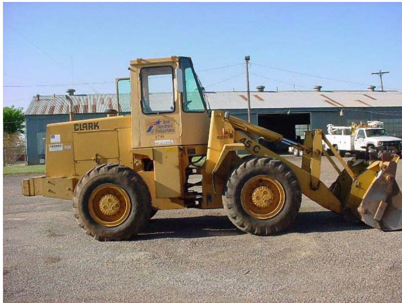
Figure 3-3. Loaders are a vital piece of equipment during a snow and/or ice event. They are used for loading material on the trucks to fight the ice and snow. They are also used to clear intersections and driveways.