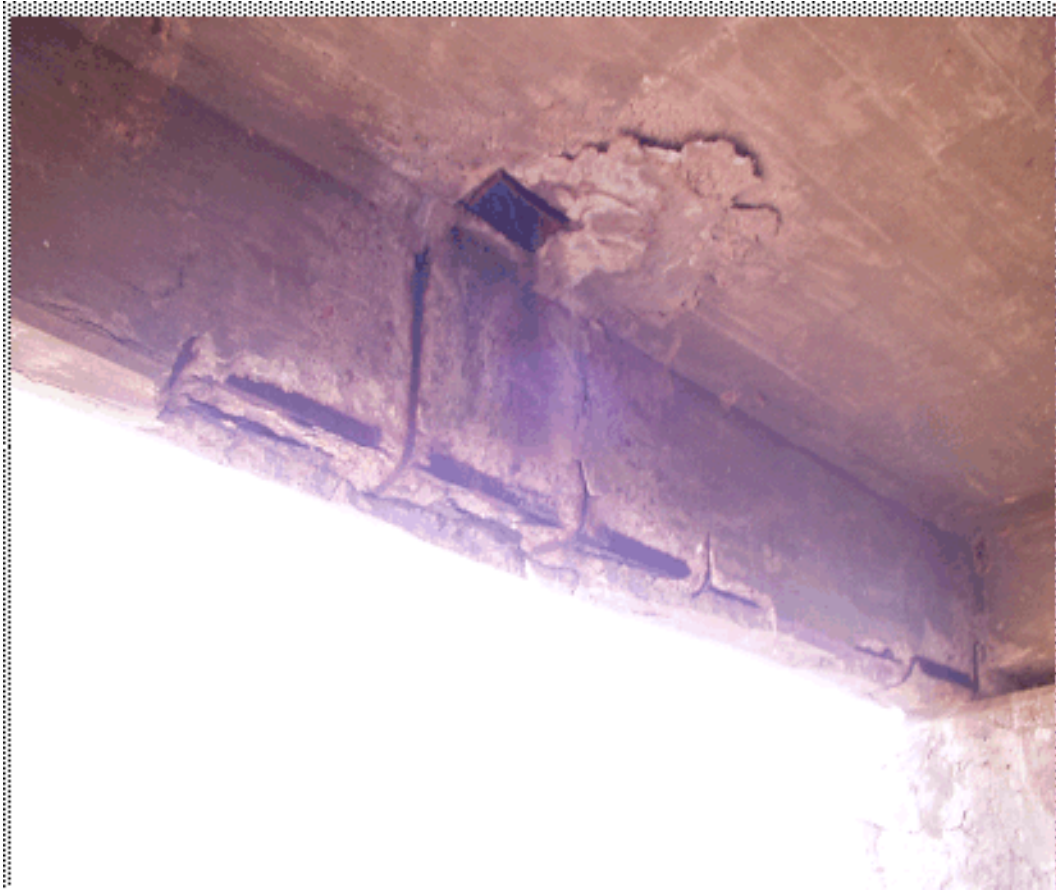
Figure 5-1. Corrosion damage due to concentrated de-icing solution at drain site.