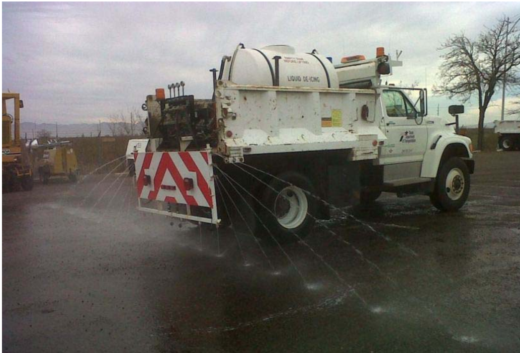
Figure 2-1. Application of liquid chemical by stream nozzles.