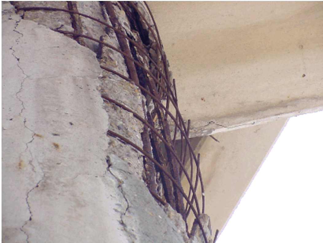
Figure 5-10. Close up of the damage. Notice the #9 bars are starting to buckle. Two reasons this could be happening: 1. Rust could be pushing on concrete causing the buckling. 2. The column could be shortening. This bridge was replaced after 20 years of service.