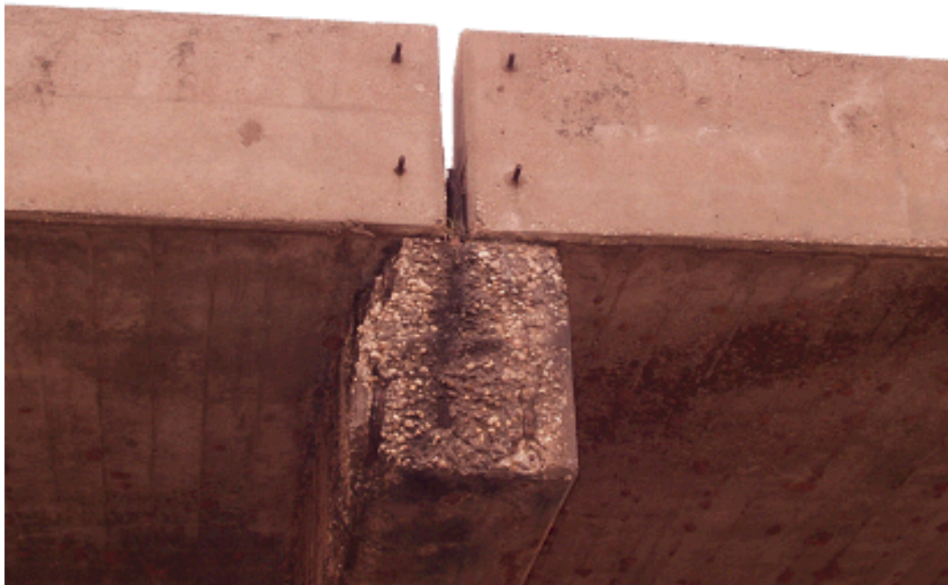
Figure 5-3. Poorly maintained joint allowed concentrated de-icer solution to damage cap.

TxDOT prefers bridge joint inspection and cleaning to be performed in the spring and re-inspection to occur prior to the beginning of snow season. This fulfills the annual bridge inspection criteria in accordance with the Maintenance Operations Manual