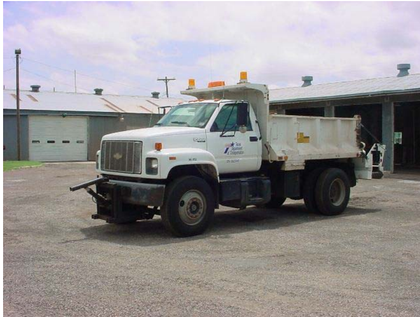
Figure 3-1. Dump trucks are the workhorses of TxDOT snow removal. Snow plows are mounted to dump trucks and are used to push the accumulated snow off the roadway. Spreaders are also mounted on dump trucks to facilitate the spreading of materials for snow and ice control.