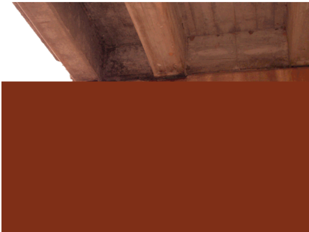
Figure 5-7. Corrosion induced damage in high stress cantilever design.

Maintenance personnel should maintain joint systems, eliminating the possibility of chemical solution saturating this structural element. If joint systems have failed, or are designed as an open system, caps should be washed at the end of snow season.