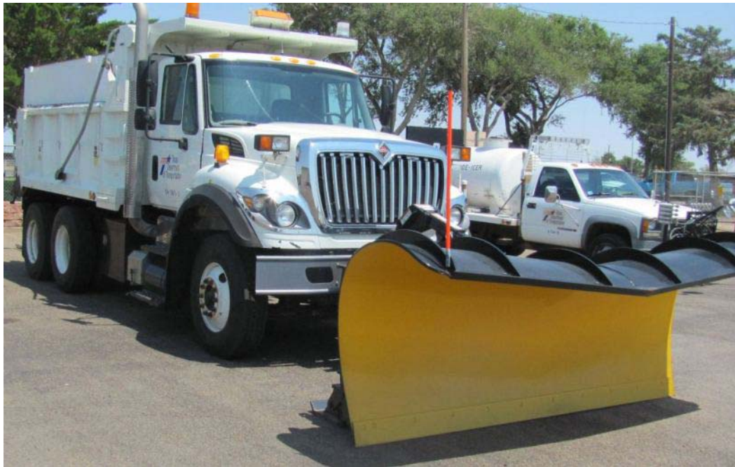
Figure 3-4. The Snow Plow is an attachment for a six- and 10-cubic yard truck. It is used to remove snow from the pavement.