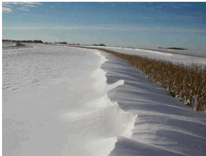
Figure 9-1. Living Snow Fence, courtesy University of Minnesota and Minnesota DOT.

Snow fences come in many different varieties and forms. There are the traditional wood fences, high-density polypropylene fabric, extruded polyethylene and even living snow fences. Living snow fences are designed plantings of trees and/or shrubs and native grasses located along roads or around communities and farmsteads. Properly designed and placed, these living barriers trap snow as it blows across fields, piling it up before it reaches a road, waterway, farmstead or community.