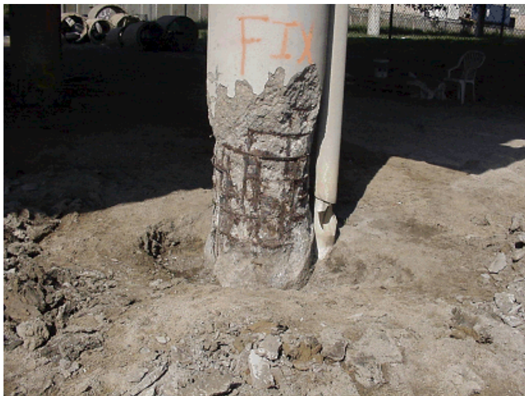
Figure 5-12. Damage created due to the salt storage.