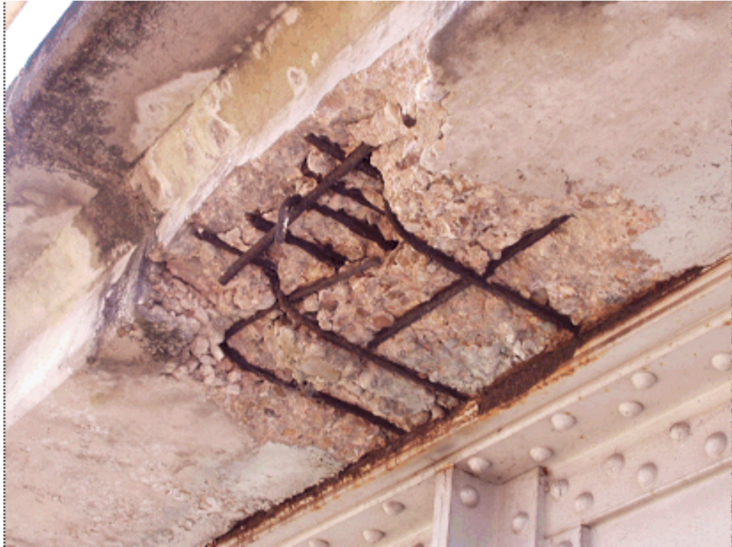
Figure 5-4. Poorly maintained joint allowed de-icer solution to damage overhang to second mat of steel and top plate steel on beam.