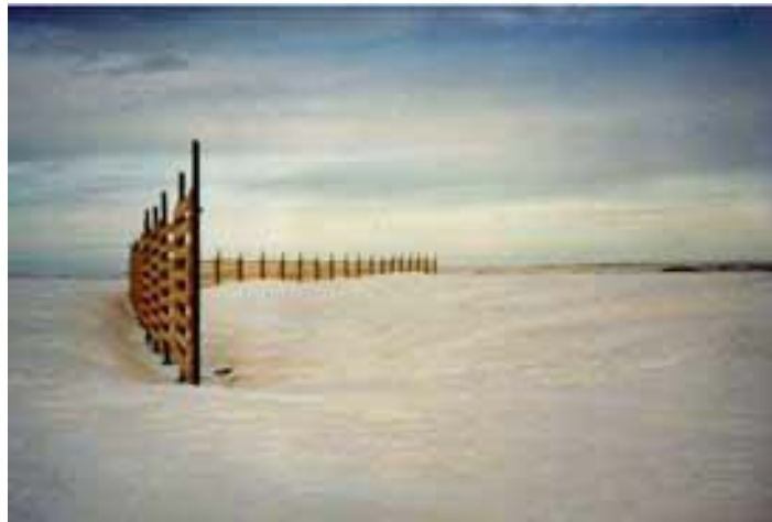
Figure 9-2. Wood Fence, courtesy University of Minnesota and Minnesota DOT.