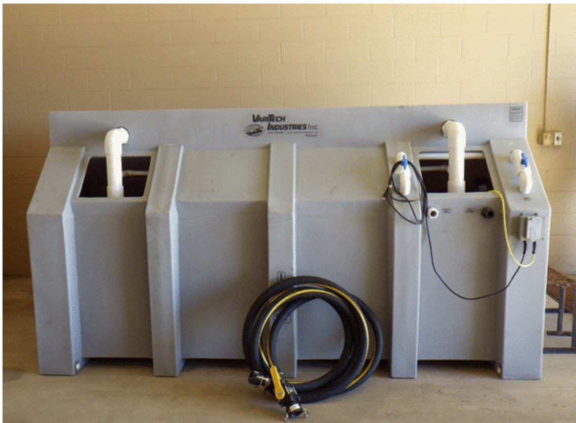
Figure 2-3. VariTech Industries Brine Maker