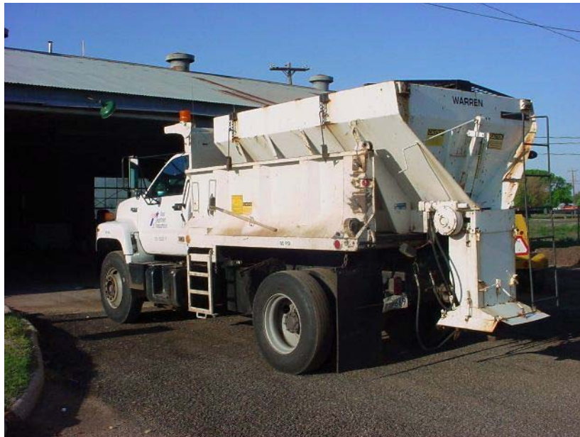
Figure 3-5. The V-Box Spreader is an attachment for a dump bed truck. It is used to accurately put out applications of de-icing materials on bridges and icy spots. These spreaders can either be hydraulic or gasoline operated.