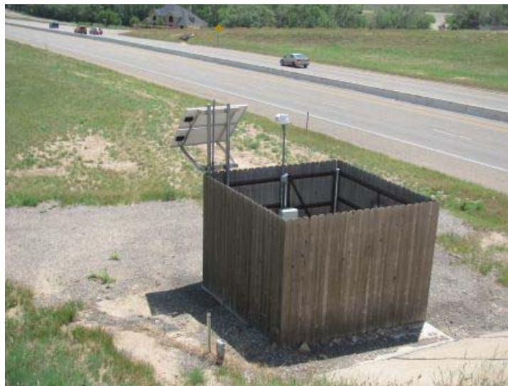
Figure 9-4. One means of achieving anti-icing is this automatic injection system in use in the Amarillo District. Photo shows chemical tank and controls, while the plumbing that gets the liquid to the road is underground.

There are two distinct snow and ice control strategies that have been gaining popularity and show promise in making use of chemical freezing-point depressants: de-icing and anti-icing. Anti-icing operations are conducted to prevent the formation or development of bonded snow and ice for easy removal, while de-icing operations are performed to break the bond of snow and ice and eliminate the buildup on the roads. See Chapter 2 , “Materials,” for information on the various chemicals available to use in these operations.