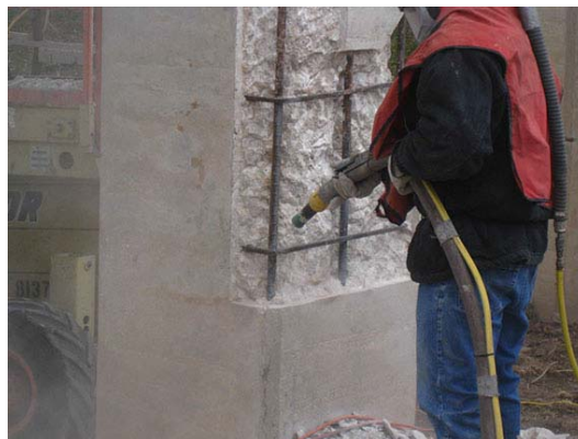
Figure 3-5. Abrasive blasting to clean reinforcing of rust/active corrosion.