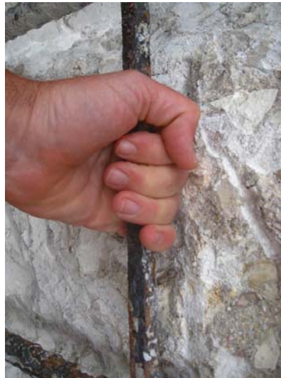
Figure 3-4. Verifying adequate clearance around reinforcing.