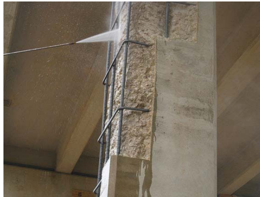
Figure 3-7. Pressurized water to clean and prepare surface (saturated surface dry).

NOTE: In the past some Contractors and Fabricators opted not to recess prestressing strands in spalled areas so the protruding sections could serve as dowels for the repair material. While the strands would serve well as dowels in those circumstances, they could be exposed to moisture and chlorides if the repair fails over the life of the structure. For that reason it is more important that the strand be completely recessed. Install anchors to hold the repair material in place.