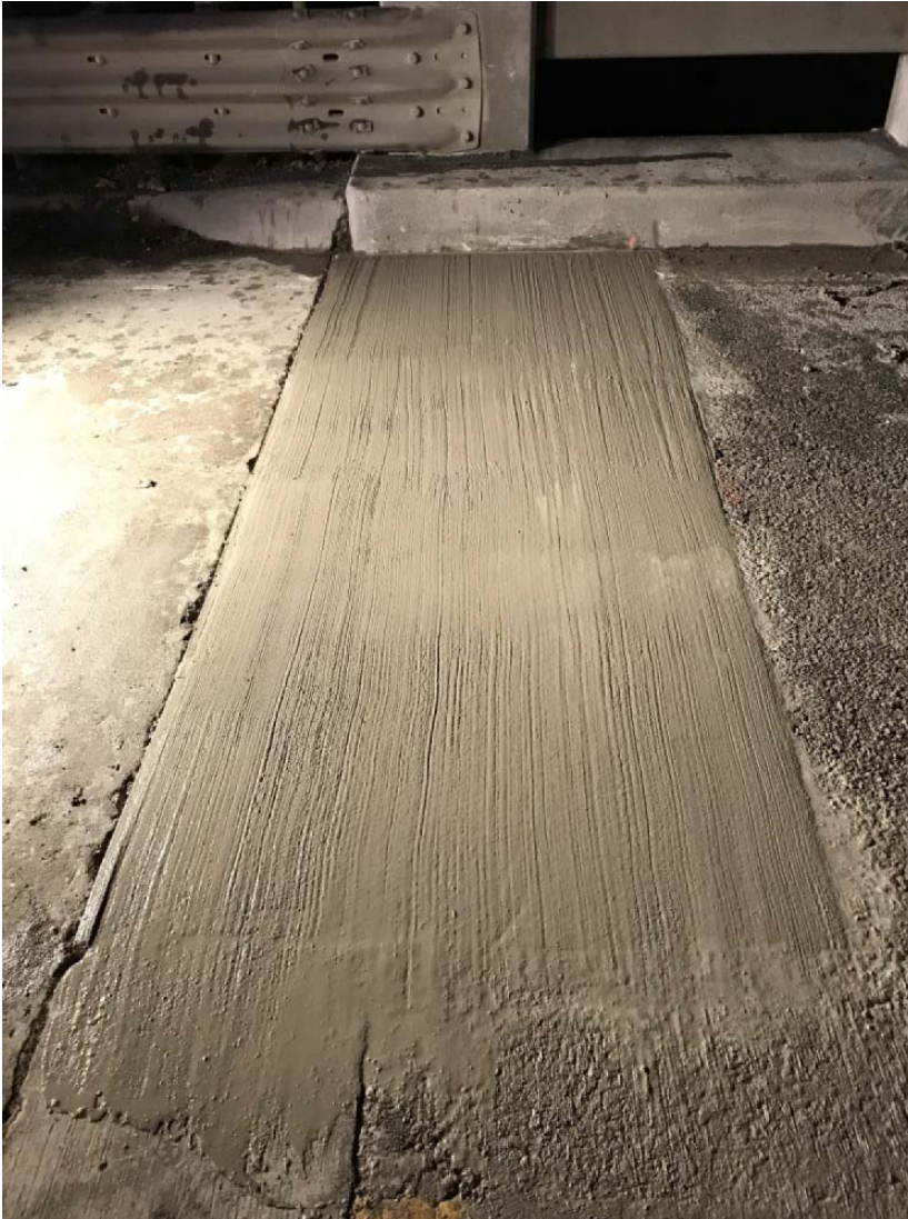
Figure 3-15. Cure and insulate concrete