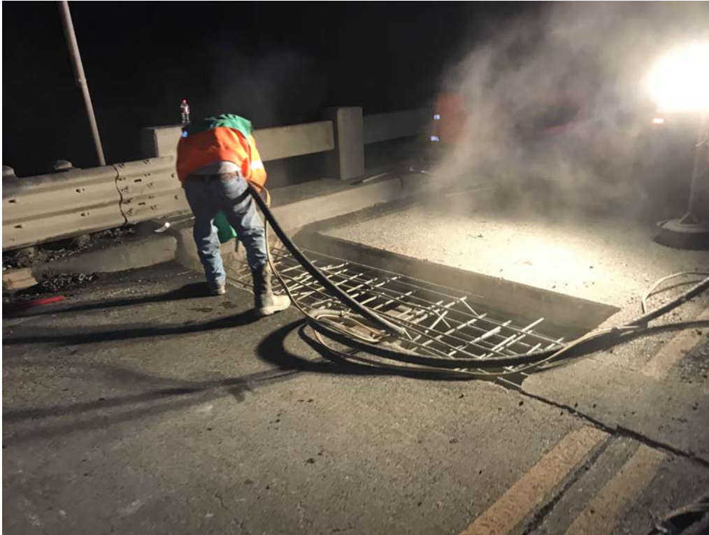
Figure 3-12. Repair area preparation (high-pressure water blasting, or other approved methods to remove dust and debris. Abrasive blasting to remove rust from exposed steel surfaces)