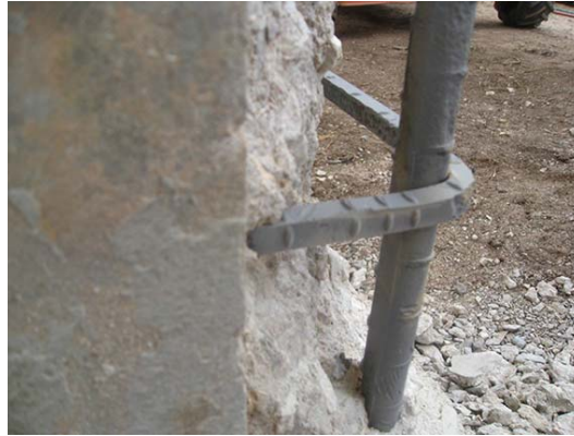
Figure 3-6. Reinforcing cleaned and free of rust.