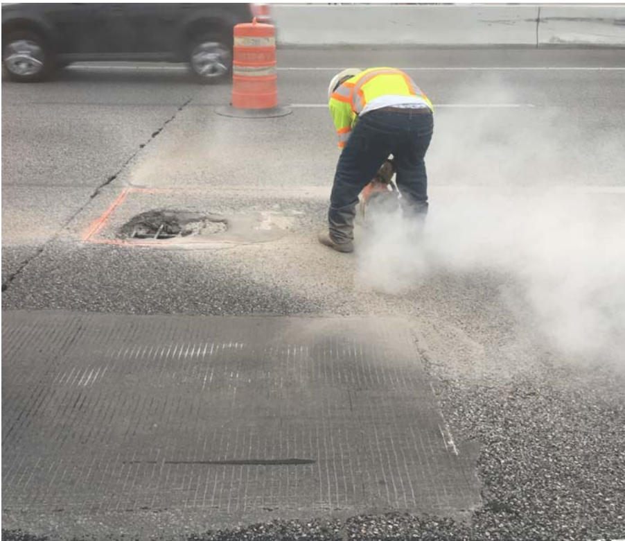
Figure 3-9. Saw-cutting along defined repair boundaries