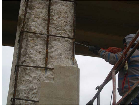
Figure 3-3. Chipping hammer used to remove unsound concrete.