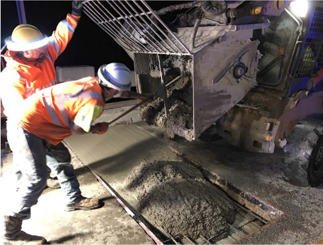
Figure 3-13. Placing the concrete