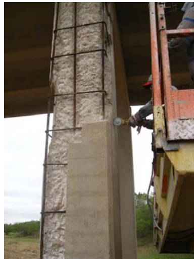
Figure 3-2. Preparation (saw-cutting) straight and squared edges to contain repair material.