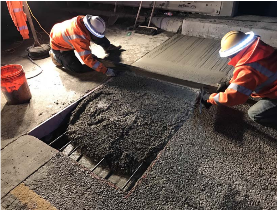
Figure 3-14. Finishing the concrete