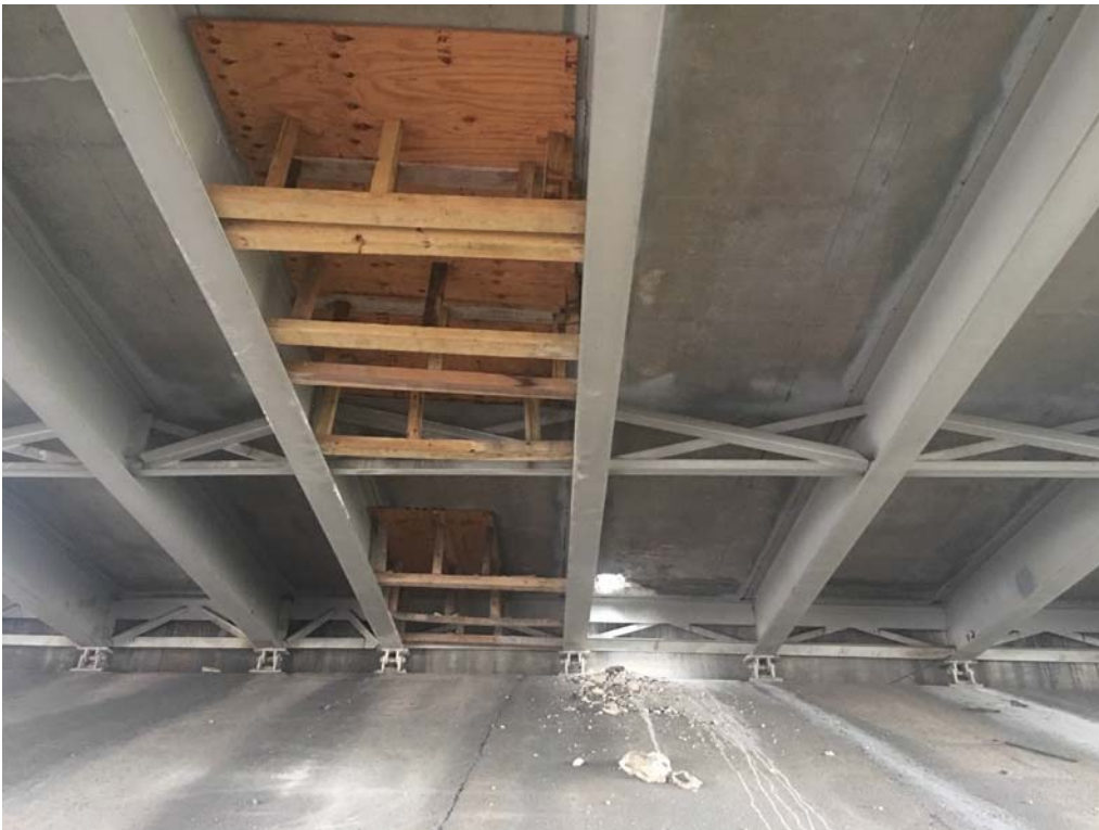
Figure 3-11. Installation of formwork