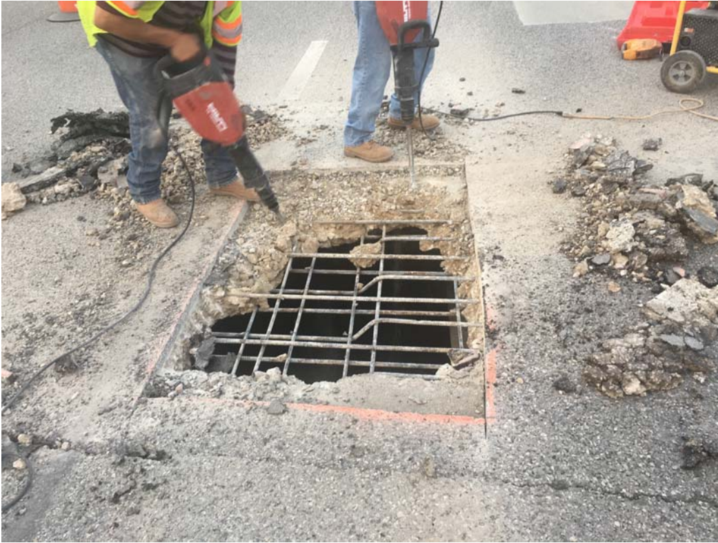
Figure 3-10. Remove deteriorated/unsound concrete